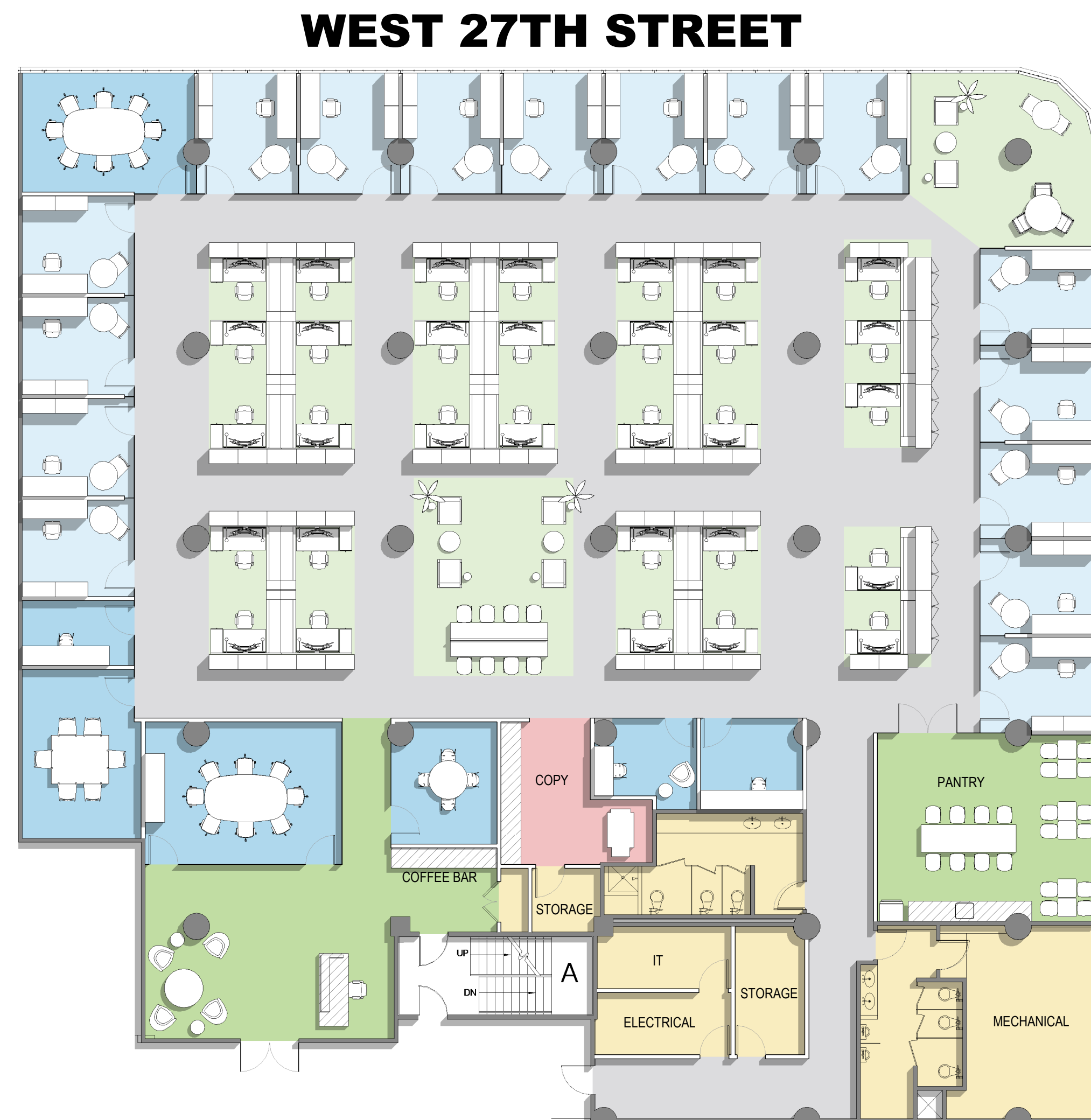
WEST 27TH STREET